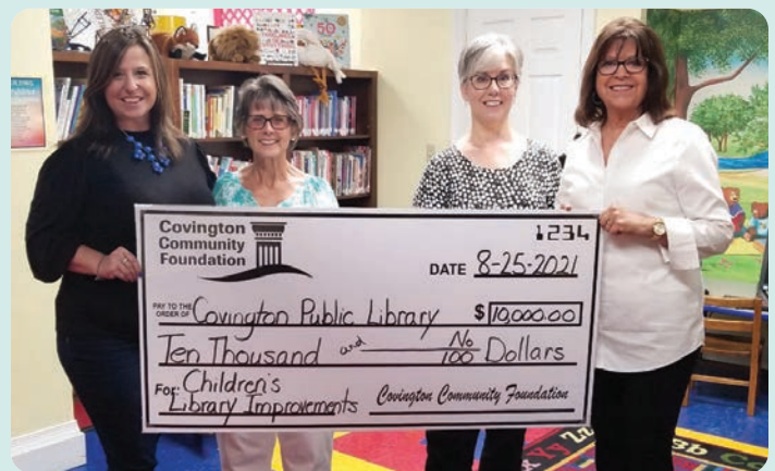
Covington Public Library - $10,000 for upgrades to the Children’s Library