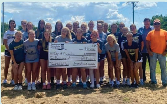
City of Covington - $10,000 for a new sand volleyball court at the city park