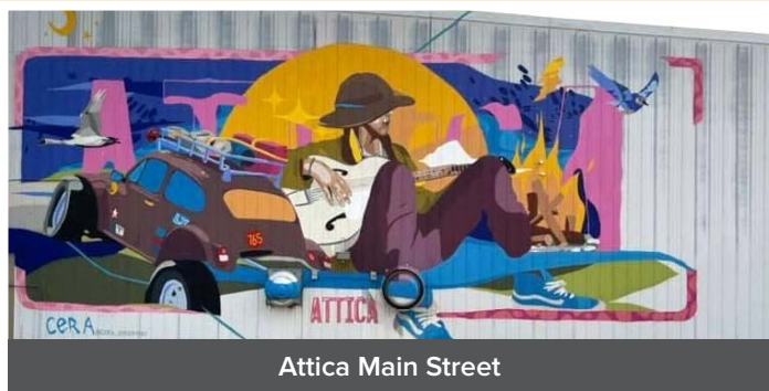
Attica Main Street

Western Indiana Community Foundation truly appreciates every gift received from our generous donors. If we neglected to mention your contribution for the time period listed, please accept our sincere apologies for the oversight.