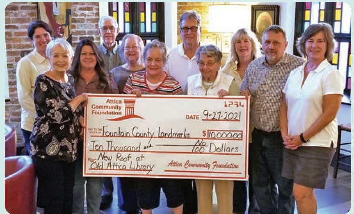
Fountain County Landmarks - $10,000 for a new roof and exterior paint/maintenance at the Old Attica Library