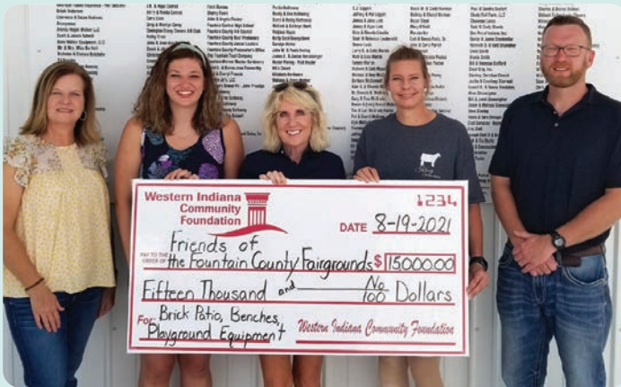
Friends of the Fountain County Fairgrounds - $15,000 for a brick patio with benches and a small play area for children