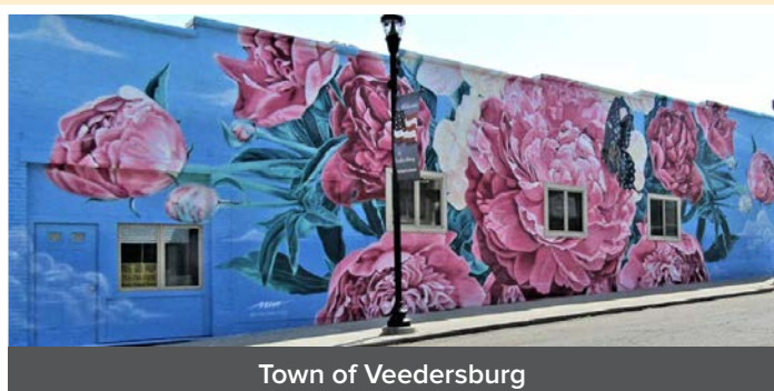
Town of Veedersburg